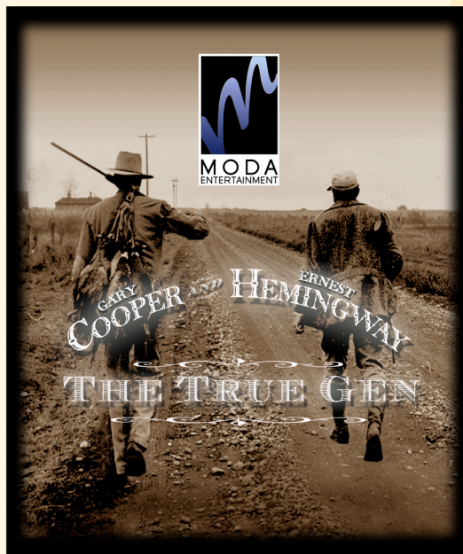
Cooper & Hemingway: The True Gen

For transcripts of past forums and more information about the Kennedy Library Forum series, visit www.jfklibrary.org .